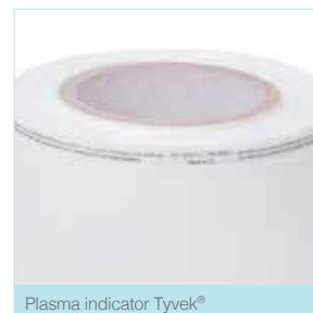
Plasma indicator Tyvek®